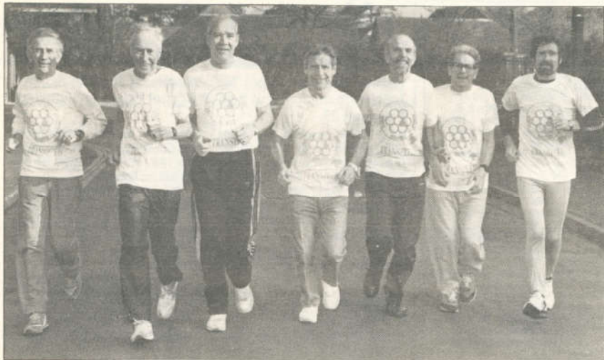
Here are the magnificent seven of Bognor Regis, average age 61, all long distance runners, who are to run the 870 miles in relay from John O'Groats to Lands End starting at 9am on May 23 — a distance they hope to cover in under one week.